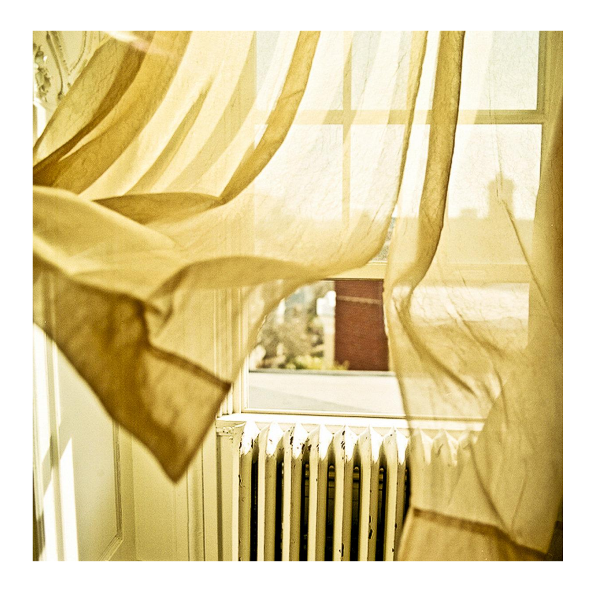
Open Window II By Sam Heydt

Screen Print – Ed.5/23 + No A/P - Screen Print - Acrylic on Arches 88 - H54cm x L76cm – Unframed - A$600