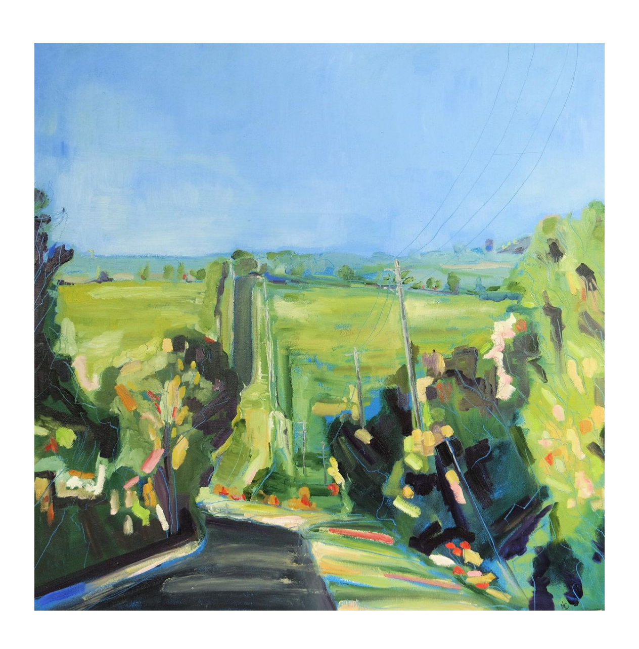
Road to Jamberroo By Marianne Cara

Oil Painting - Heading South, Where the Sea Makes a Noise Series - Oil Painting on Canvas - Stretched Canvas -H101cm \times L101cm \times D3cm - A$1500