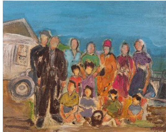
"Connections 5" and "Connections 6" by Marianne Cara